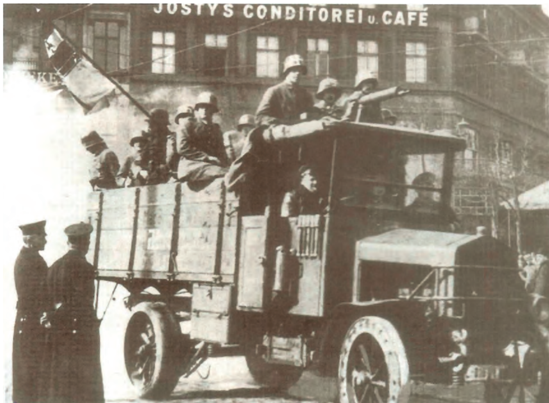
A photograph taken in Berlin in 1920, during the Kapp Putsch.