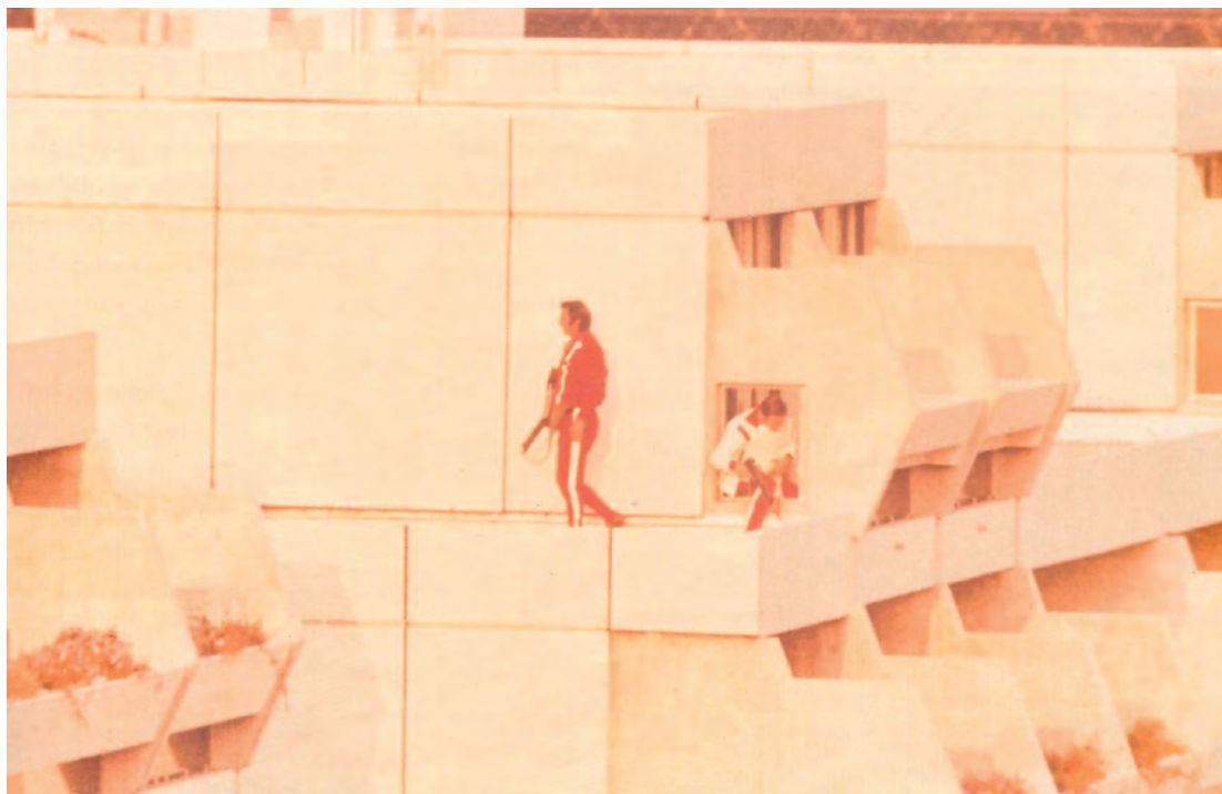
A photograph of an armed German policeman on a building in the Olympic village, Munich 1972.

20 Look at the photograph, and then answer the questions which follow.