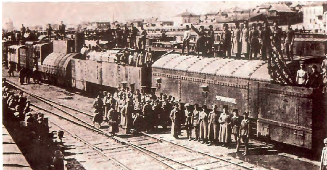
A photograph of an armoured train used by the Bolsheviks during the Civil War.

11 Look at the photograph, and then answer the questions which follow.