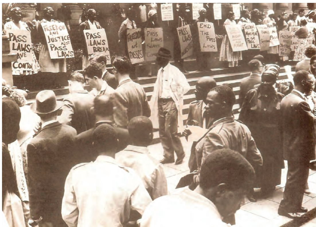
A photograph of women demonstrating against the pass laws in Johannesburg, 1955.

18 Look at the photograph, and then answer the questions which follow.