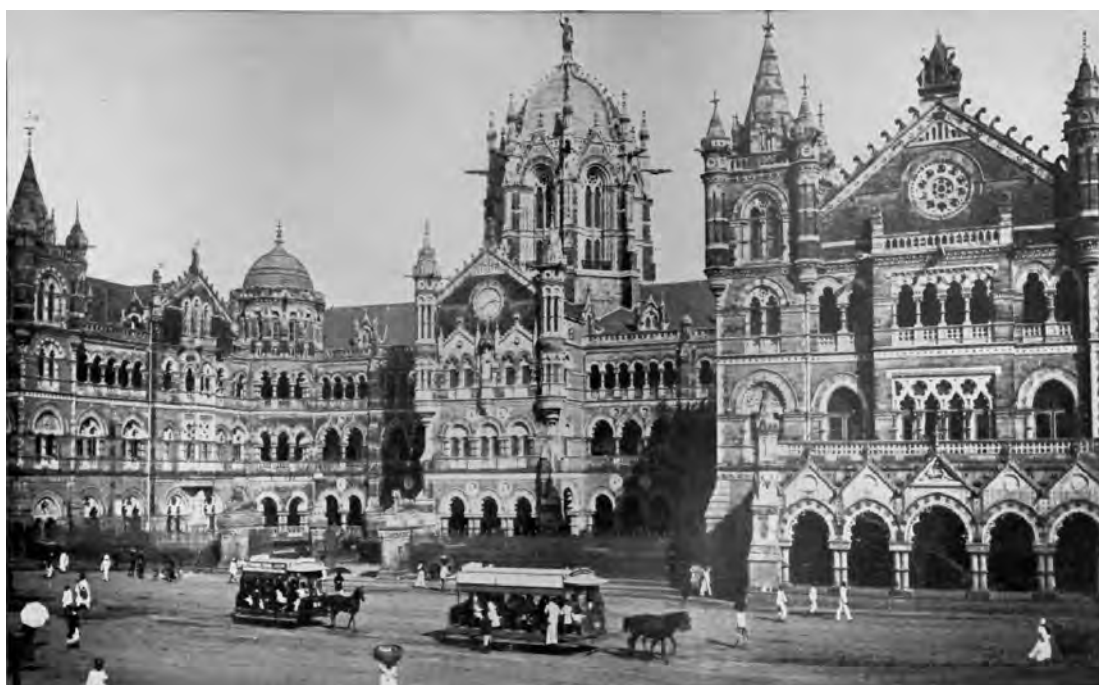
Victoria Railway Station, Bombay.

25 Look at the photograph, and then answer the questions which follow.