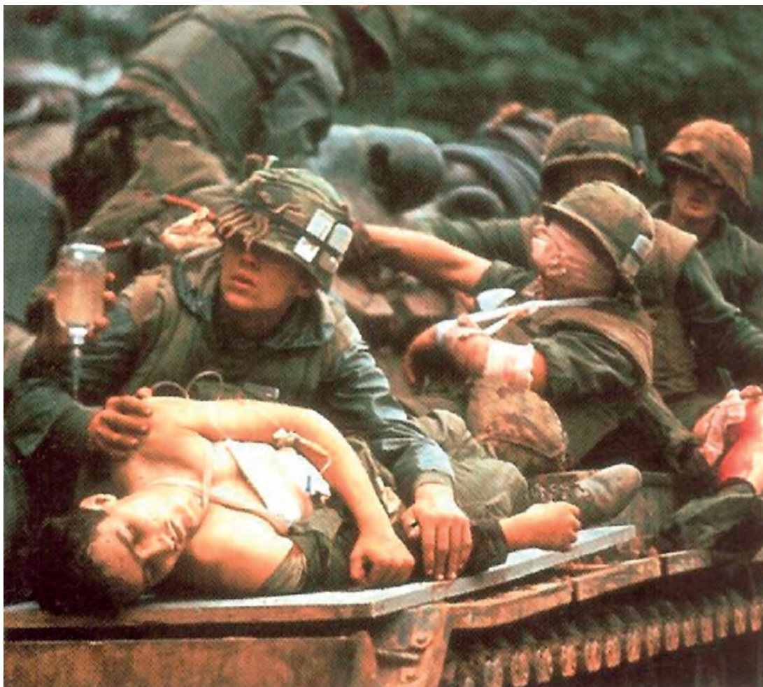
A photograph of wounded US Marines in Saigon during the Tet Offensive, 1968.

7 Look at the photograph, and then answer the questions which follow.